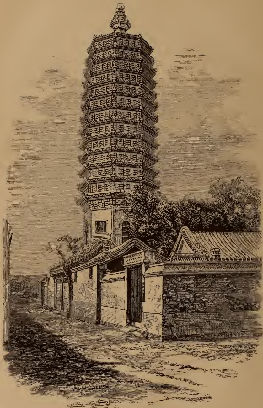
A PAGODA AT TUNG-CHO.